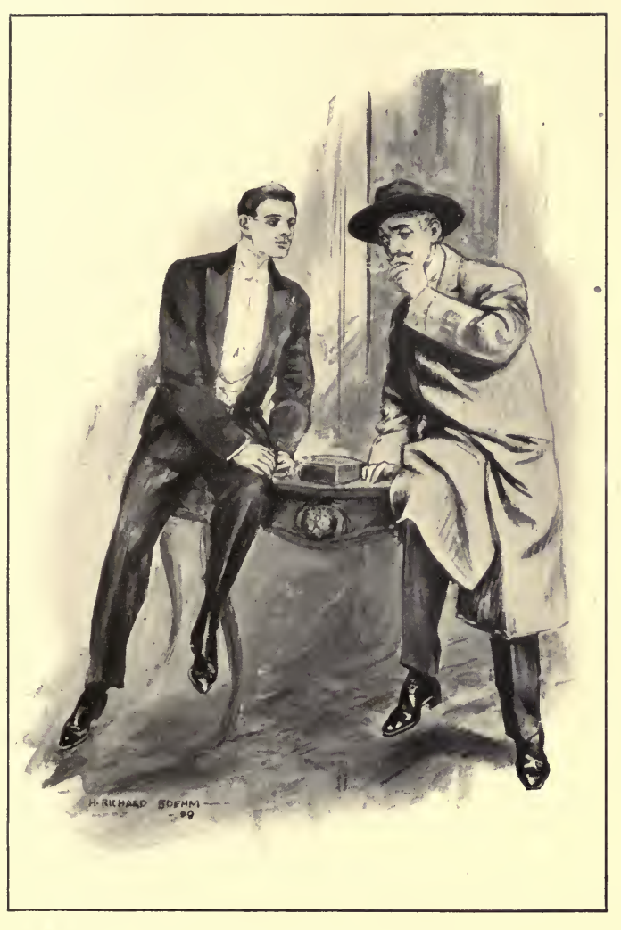
"'Well . . . the coronet . . . is it in this case?' he said in a shaky voice"